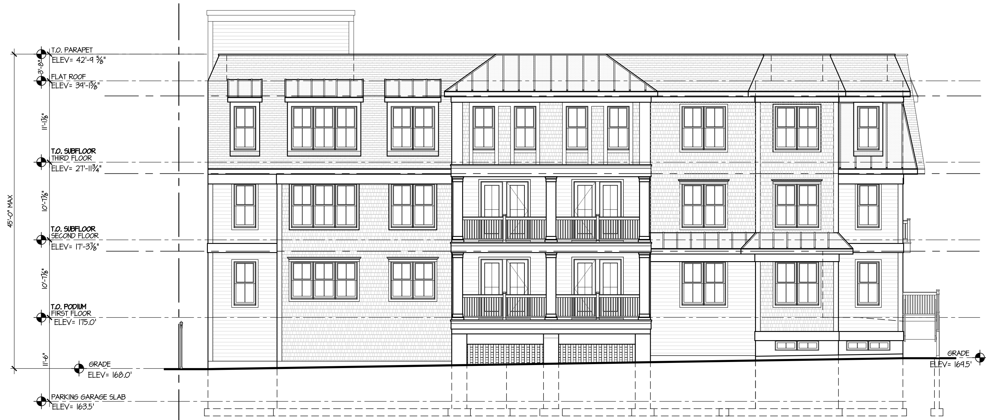
A PROPOSED FRONT ELEVATION FACING MEADOW RD. (SOUTH) A4.2 SCALE: 1/8" = 1'-0"

R&M ENGINEERING Robinson & Muller Engineers, P.C. Huntington, NY 11743 Office: (631) 271-8878 Fax: (631) 271-8892 www.rnm-engineering.com